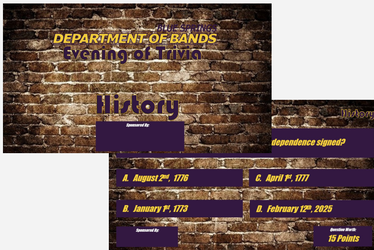
Name on Question Slides