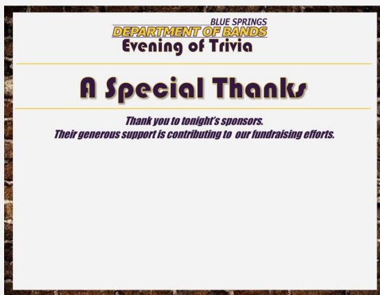
Check-in Table Signage