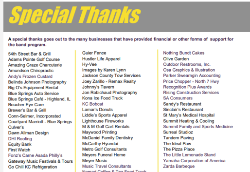
Special Thanks in Annual Seasons Highlights